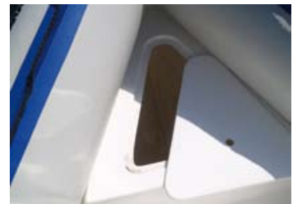
The centre console features a small storage facility in the front and a much bigger hatch on the driver's side.