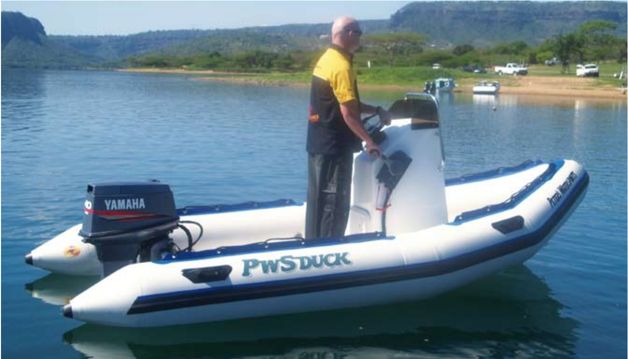
Compactness and simplicity is the key to this 4.3 m semi-rigid, perfect for the entry-level boater!

The pontoon tubes are made from 1000 gsm (grammes per square metre) imported PVC inflatable boat fabric. The chambers are split into three separate compartments and the boat is built strictly to the requirements of the law.