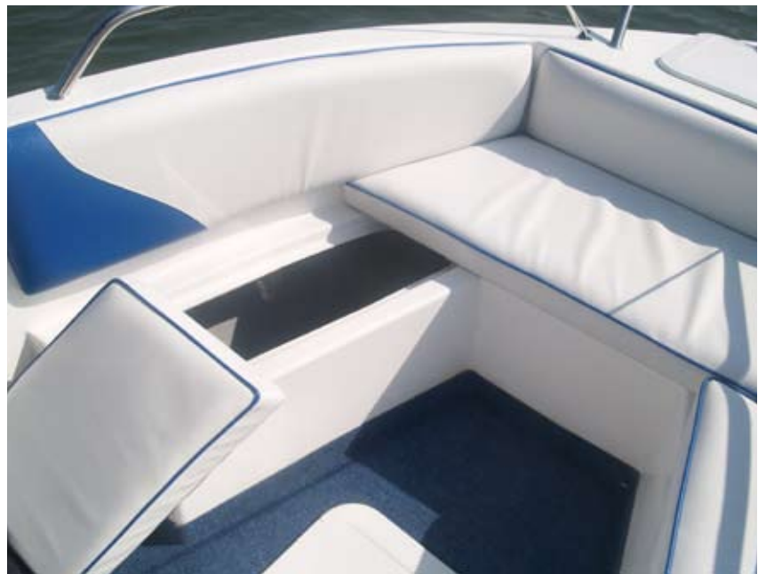
Caption XXXX caption XXXXX caption Caption XXXX caption XXXXX caption