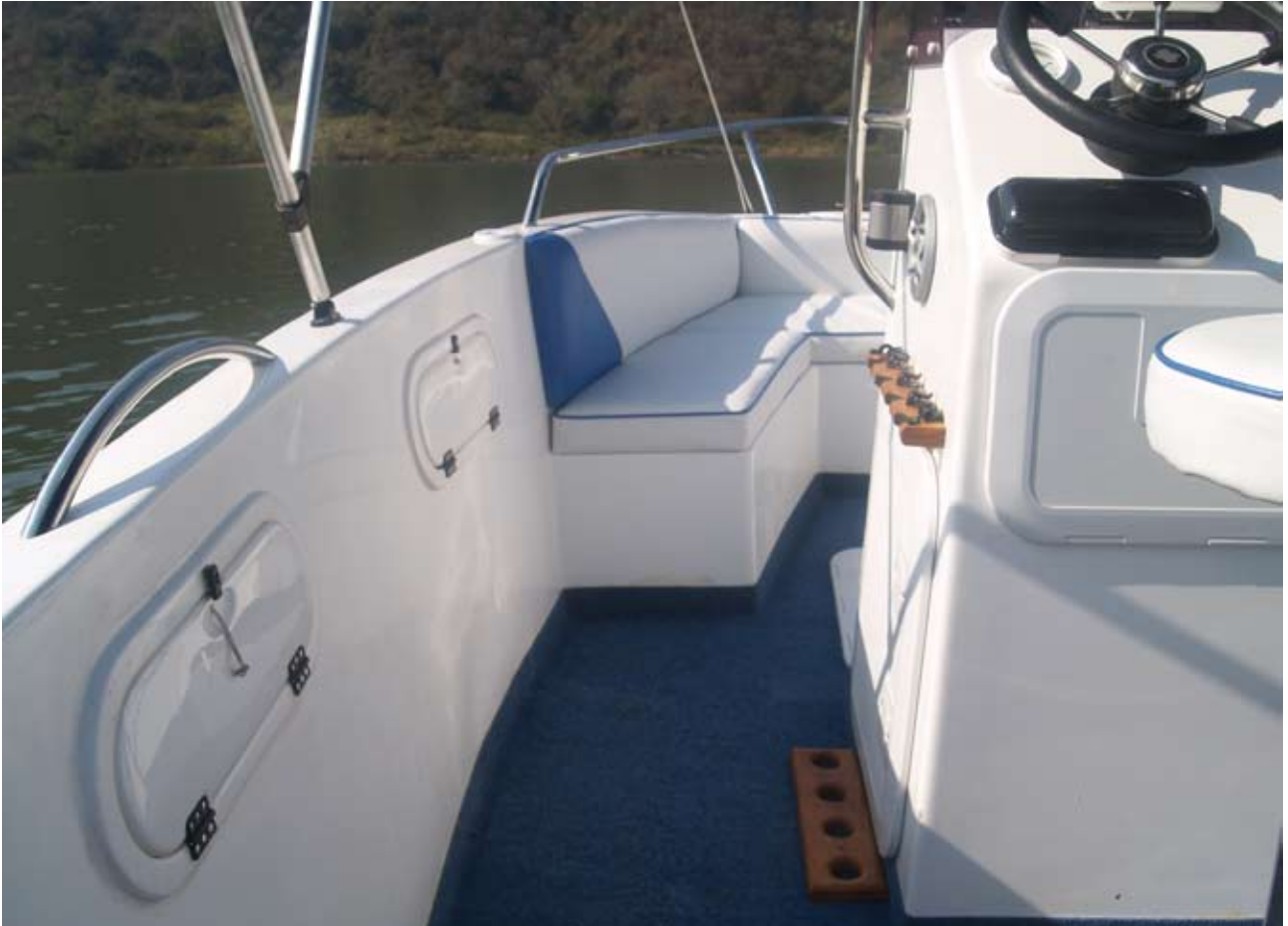
Caption XXXX caption XXXXX caption