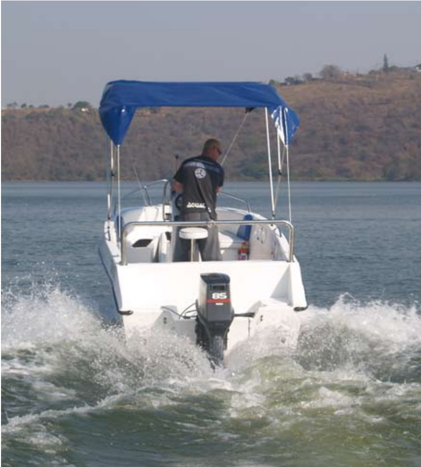
Caption XXXX caption XXXXX caption Caption XXXX caption XXXXX caption