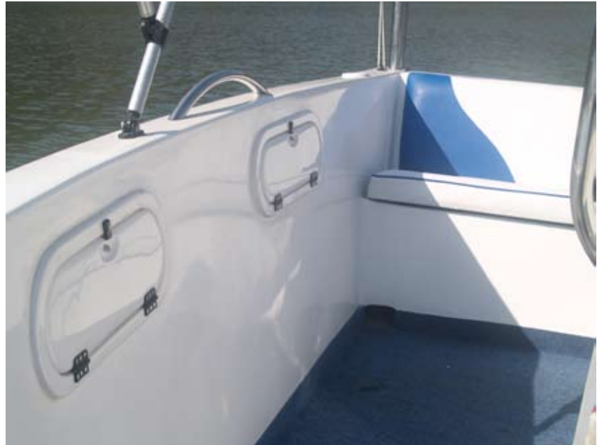
Caption XXXX caption XXXXX caption Caption XXXX caption XXXXX caption

There are port and starboard lights as well as a night light. A blue canopy was fitted but it was a bit too high for my liking. It tended to wobble around quite a bit when travelling, but it should be easy to cut it down to a lower height.