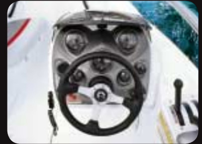
Full instrumentation dash