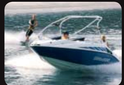
Optional blue and optional wakeboard tower